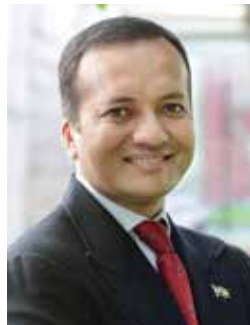
Shri Om Prakash Jindal Founder, OP Jindal Group Eminent Industrialist and Renowned Philanthropist

“In any industry a quality product is one that meets the exact pre-stated specifications of the customer. Similarly a skilled technician is one who is able to meet the performance expectations stated by the job market.”